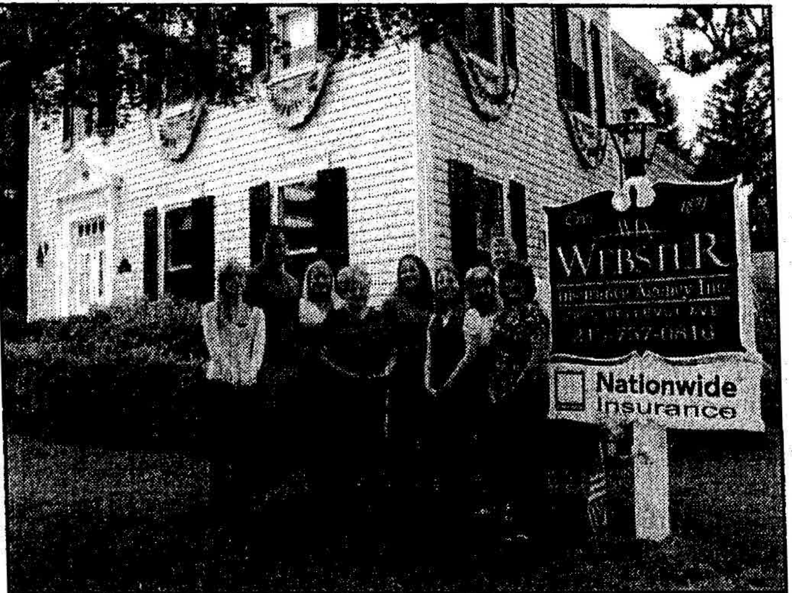
The staff of Webster Insurance Agency, Inc.